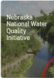
Nebraska National Water Quality Initiative