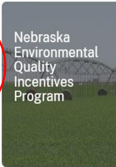
Nebraska Environmental Quality Incentives Program