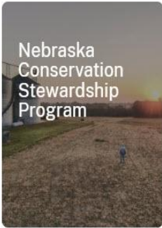
Nebraska Conservation Stewardship Program