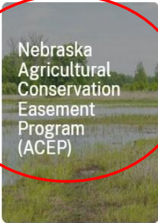
Nebraska Agricultural Conservation Easement Program (ACEP)

NRCS uses conservation initiatives to accelerate the benefits of voluntary conservation programs, such as cleaner water and air, healthier soil and enhanced wildlife habitat. These initiatives enhance the locally driven process to better address nationally and regionally important conservation goals that transcend localities. They build on locally led efforts and partnerships, and they're based on science. Through the initiatives, NRCS and its partners coordinate the delivery of assistance where it can have the most impact.